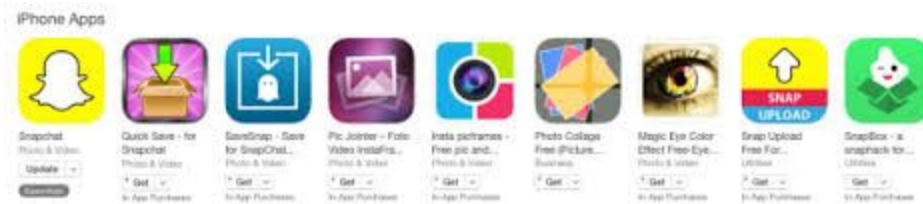
3rd Party Snapchat Intercept Apps

3rd party Apps Designed to Intercept snapchat messages which then can be sent out anywhere on the web. (and on other social media platforms).